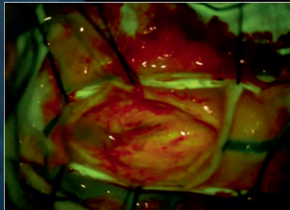
Lumbar spinal tumor with ZEISS YELLOW 560 4